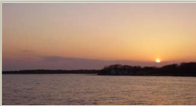
Sunset from Our Private Beach

The perfect setting for weddings, receptions, parties, luncheons, reunions, retirement dinners, anniversaries, intimate getaways, bridal showers, bachelor / bachelorette parties, family gatherings and more.